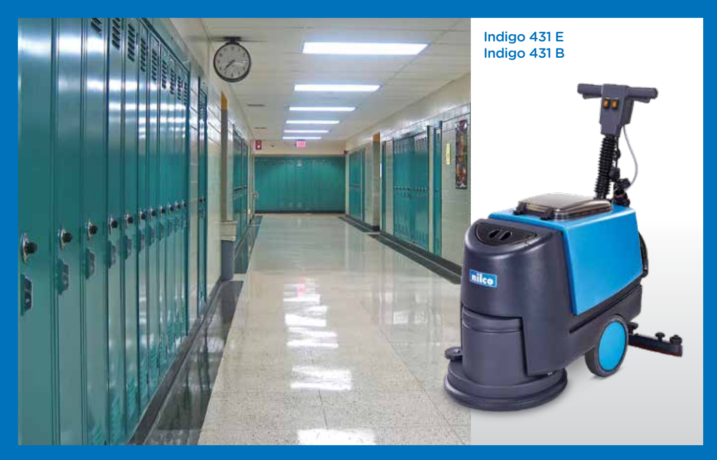
Service quality nprovement