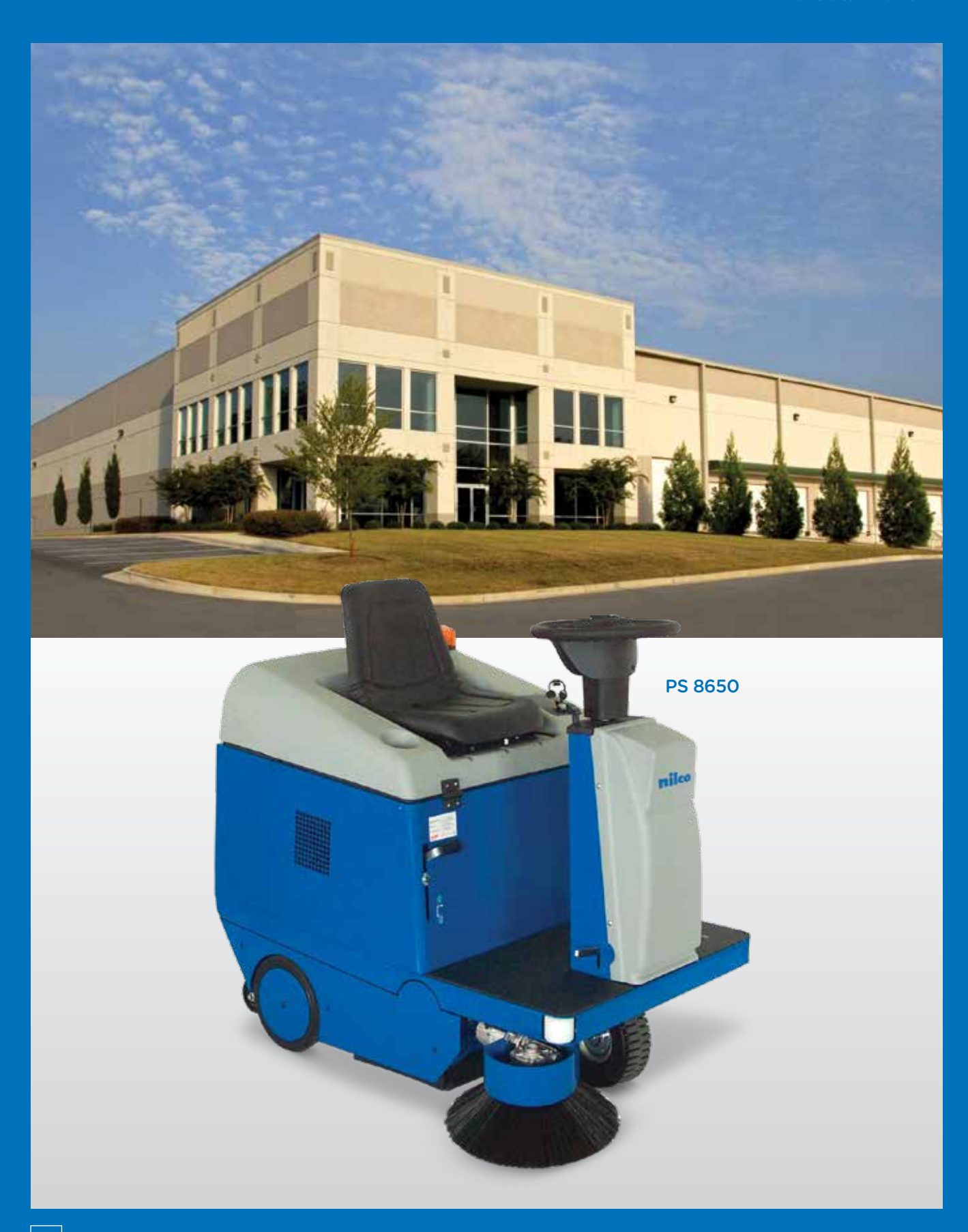
Strong vacuum, high