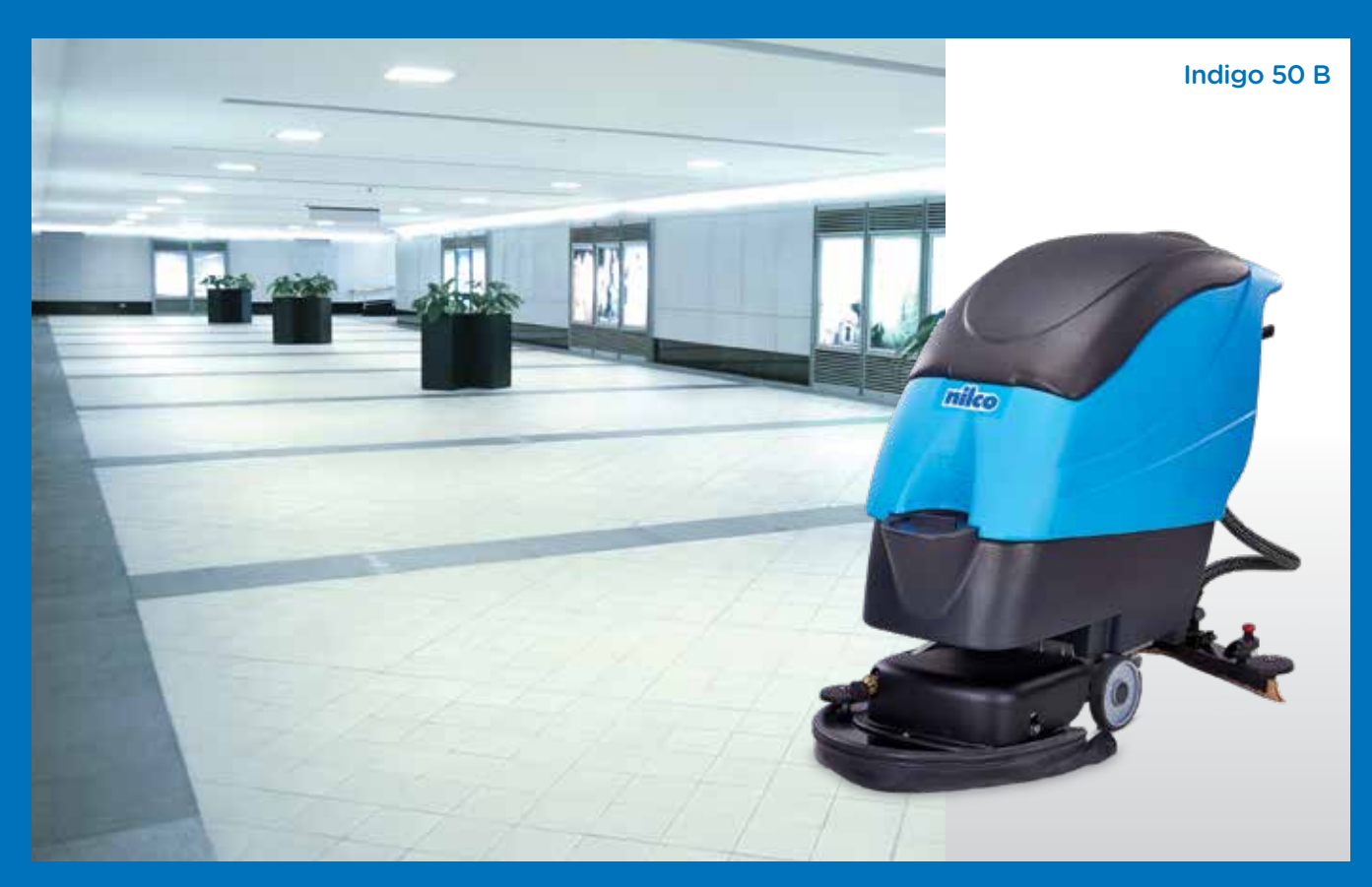
Service quality improvement